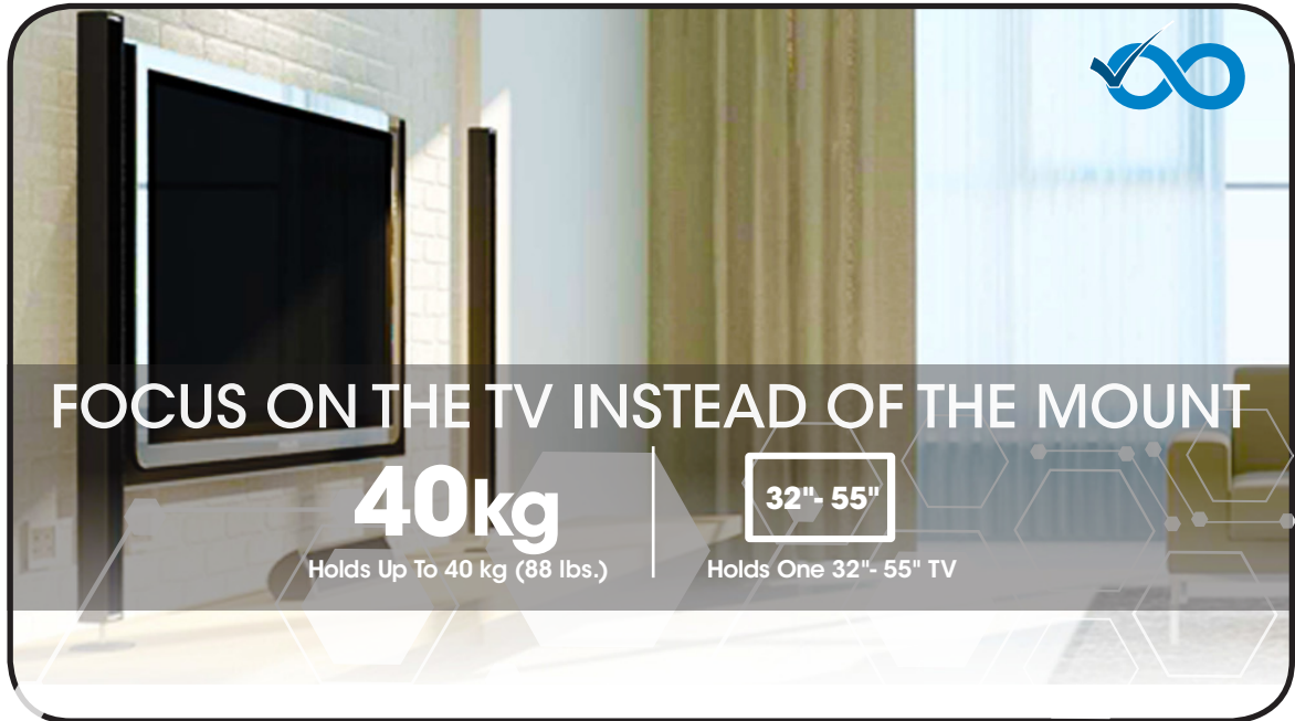
Whole Wall Frame